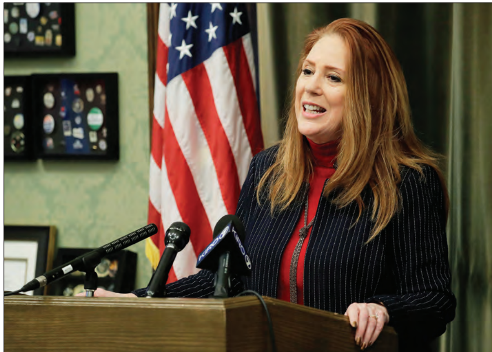
Washington Secretary of State Kim Wyman talks to reporters in her office on Jan. 15, 2020, at the Capitol in Olympia. Wyman's office operates the VoteWA.gov website, which allows Washington voters to check on the status of their ballots.

Once voters type in their names and birthdays, they'll get a voter guide specific to their neighborhoods. Names of all the candidates who will appear on their ballots will be included, as will other information and background about candidates who choose to participate in the voter guide. If a proposition or initiative is on a voter's ballot, the voter guide will include information about those as well as statements in favor and opposed, if citizens stepped forward to provide them.