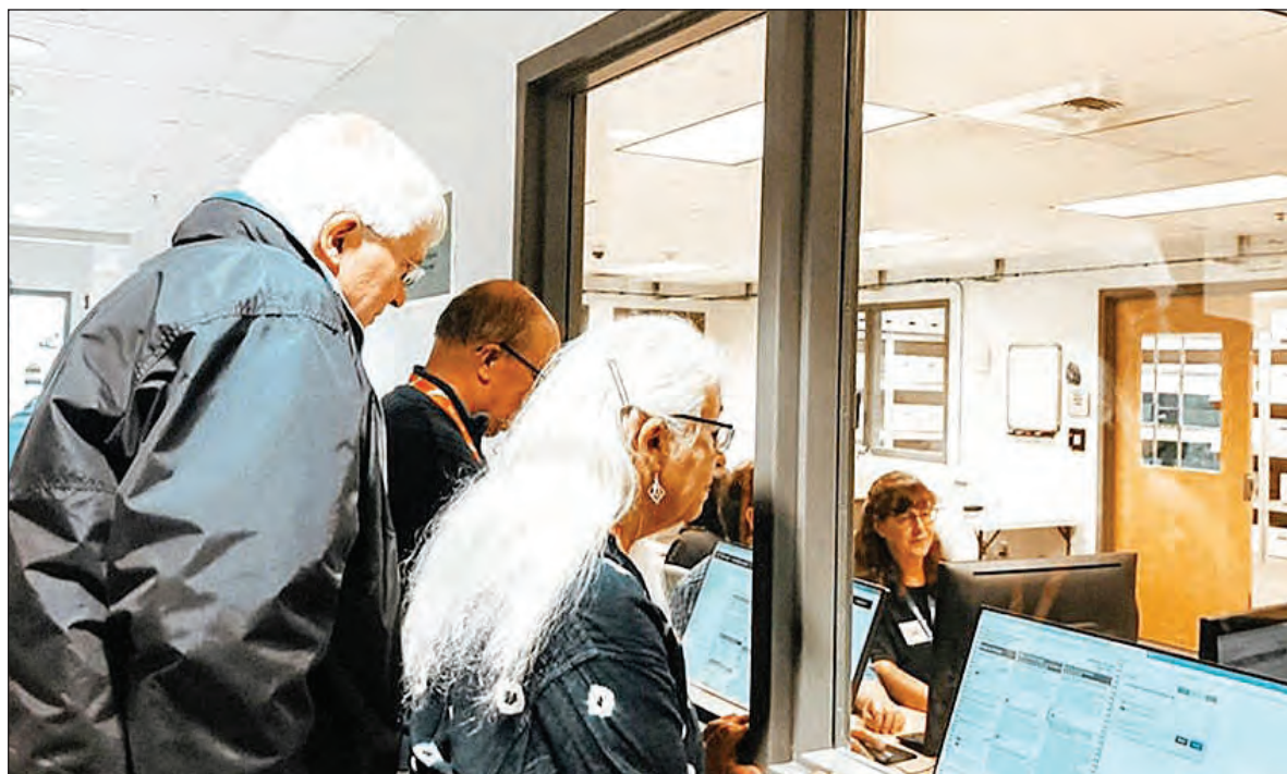
The Pierce County Auditor's office is large enough to feature a glass-fronted walkway where observers can watch election officials at work.