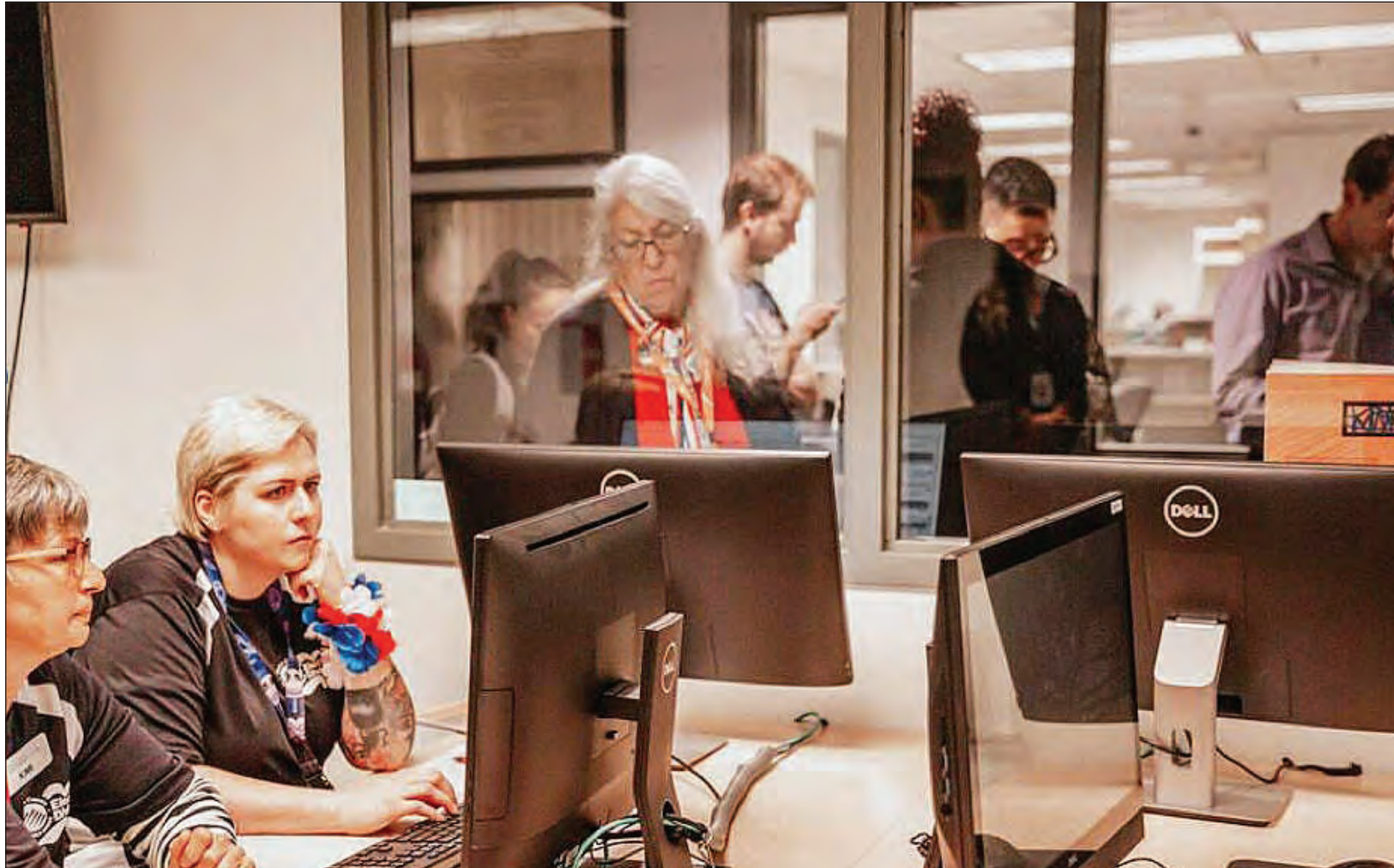
Observers in Pierce County watch election officials at work from a glass-fronted walkway.